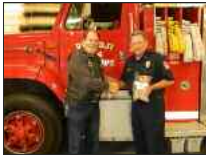
NORTH STAR CHAPTER BUDDY BEAR DROP