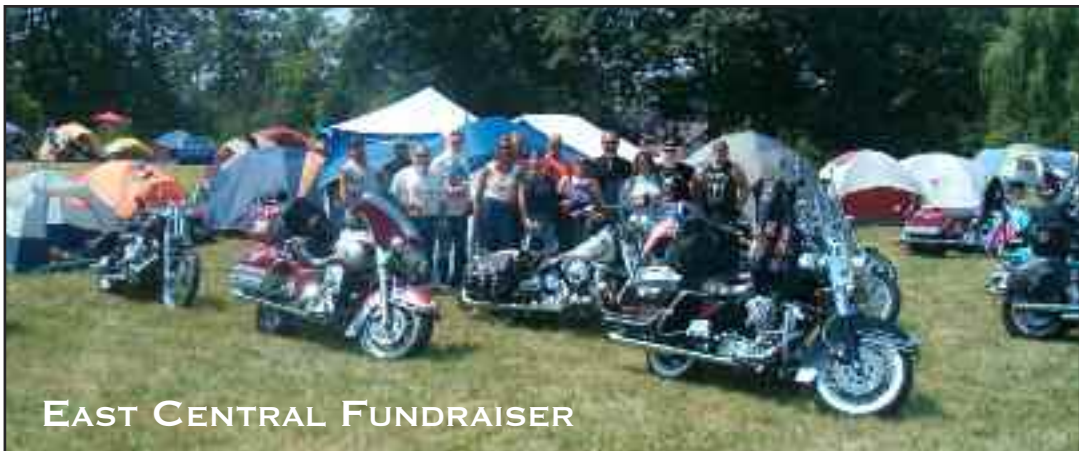
EAST CENTRAL FUNDRAISER